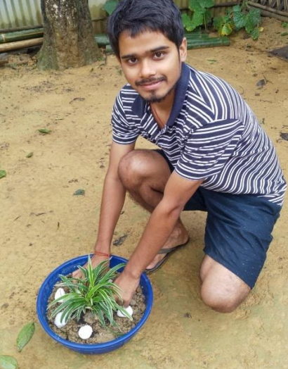
<u>Dibojit, Dibrugarh (Assam)</u>