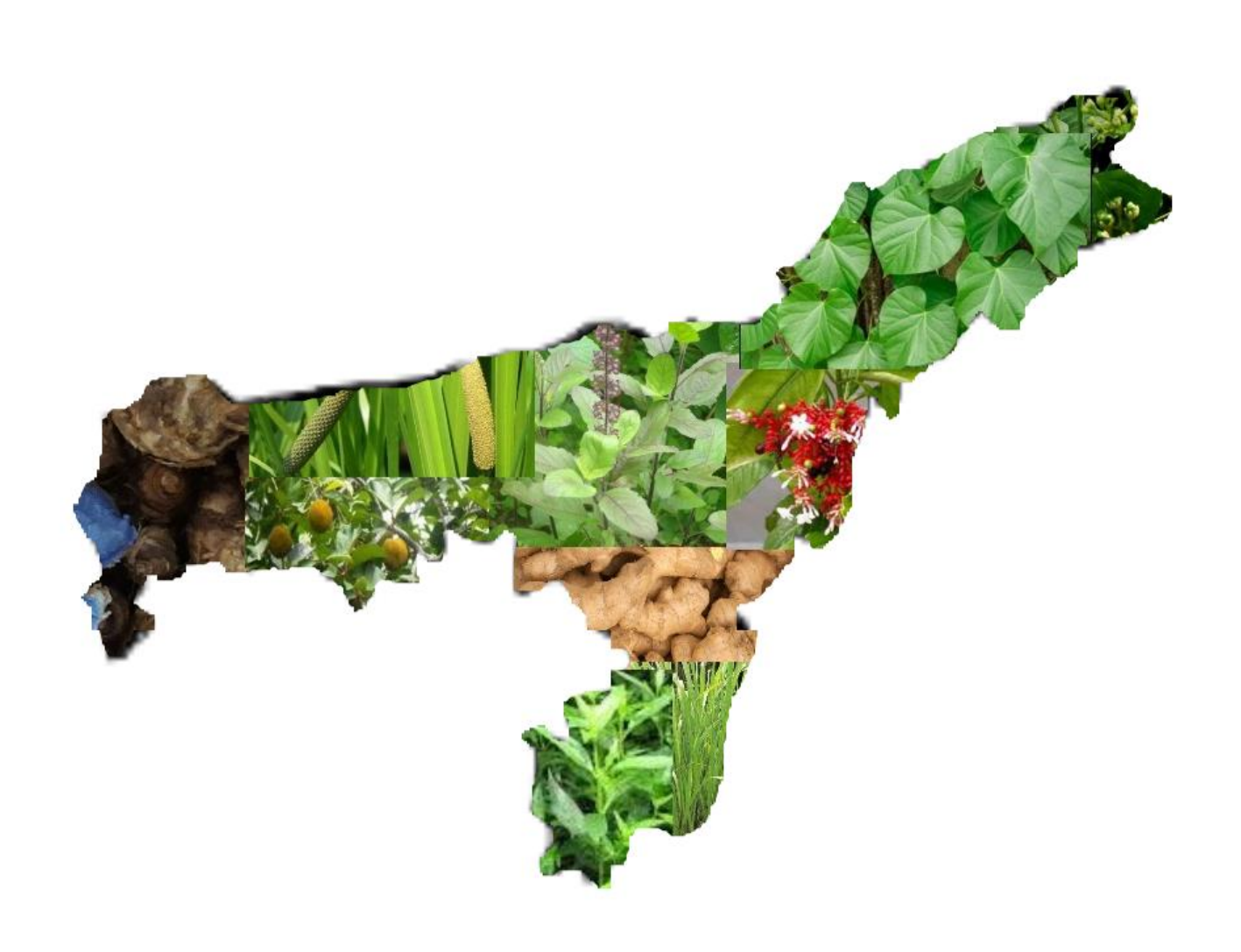
Fig- Photo Collage of Medicinal Plants of Assam in the map of Assam