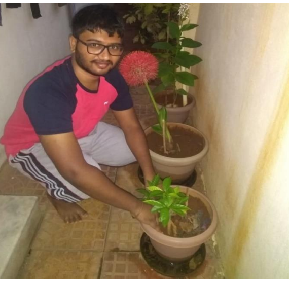
Goutham, Hyderabad (Telangana)