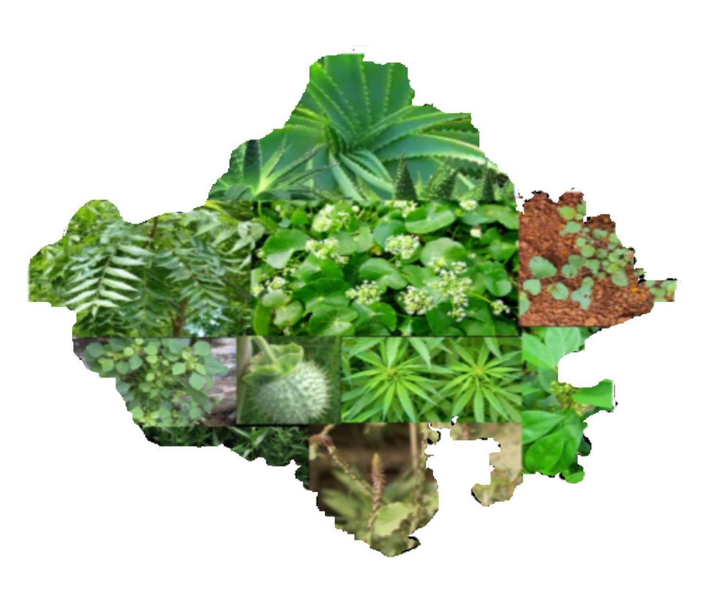
Fig- Photo Collage of Medicinal Plants of Rajasthan in the map of Rajasthan