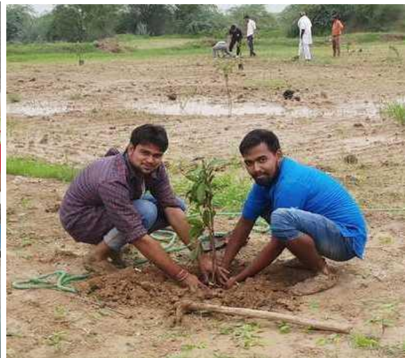
Nihal, Betul (Madhya Pradesh)