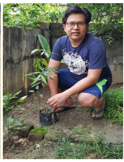
Nabaneeroj, Tezpur (Assam)