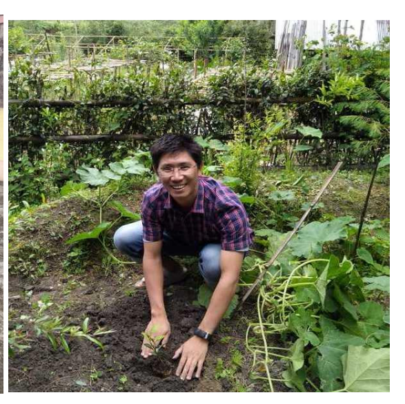
Dusu, Ziro (Arunachal Pradesh)