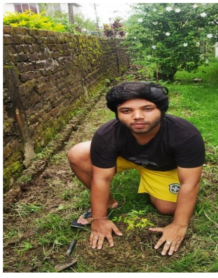
Gaurishankar, Jorhat (Assam)