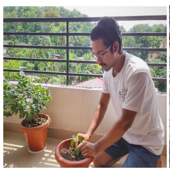
Dheejyoti, Guwahati (Assam)